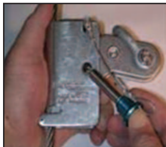
4. Close assembly, align holes and reinsert safety locking pin.