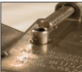
5. Make sure that locking pin balls appear on outside of main assembly.