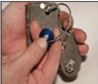
1. Depress the button on the safety locking pin and remove from main assembly.

Use only on 5/16" - 3/8" diameter galvanized or stainless steel 7x19 aircraft cable (non-lubed) with minimum tensile strength of 8,000 lbs.