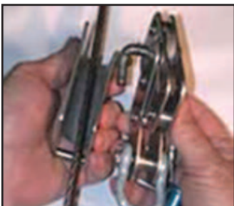
3. Place rope grab on rope with direction arrow pointing up.