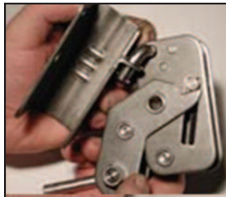
2. Swing cam and level-assembly up and open.